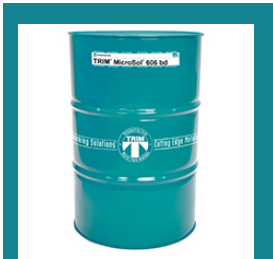
54-gallon drum SKU: MS606BD/54 UPC-12: 641238038467