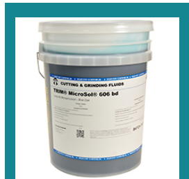
5-gallon pail SKU: MS606BD/5 UPC-12: 641238038450