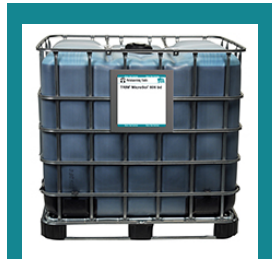
270-gallon tote SKU: MS606BD/ NR270P UPC-12: 641238038504