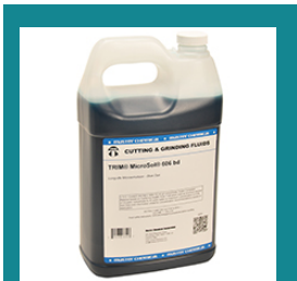
1-gallon jug SKU: MS606BD/1 UPC-12: 641238038443